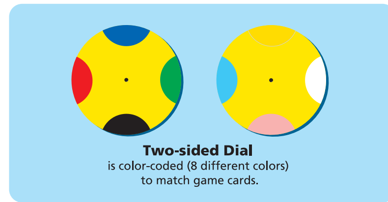
Two-sided Dial is color-coded (8 different colors) to match game cards.