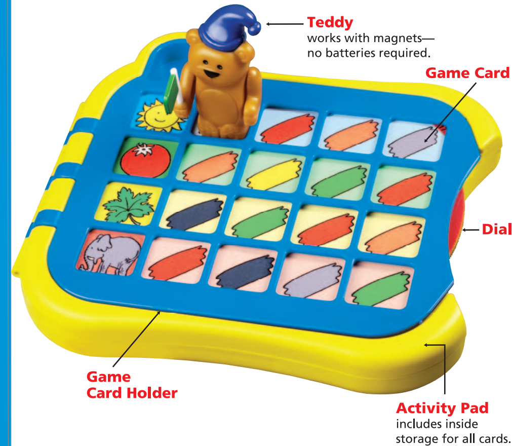
Game Card Holder

With Teddy, the unique teaching bear, children learn colors, shapes, visual discrimination, counting, and much more!