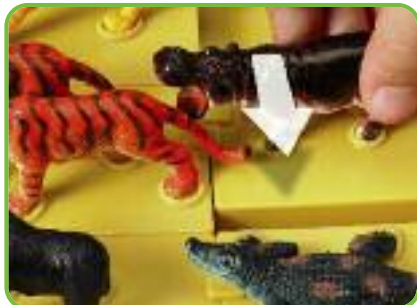
tangled in a tail!