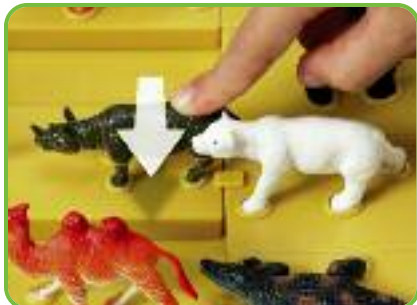
stopped by a snout!