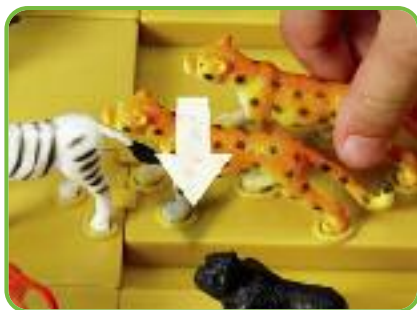
caught in a heads or tails trap!