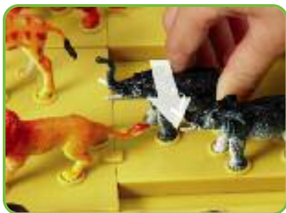
tripped up by a trunk!