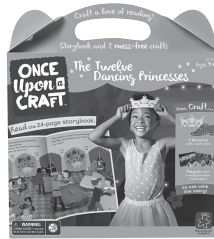
EI-1112 The Twelve Dancing Princesses