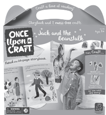
EI-1116 Jack and the Beanstalk

Tell us what you THINK! REVIEW this product at educationalinsights.com