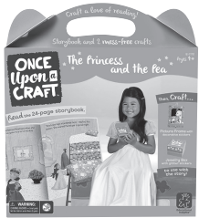
EI-1110 The Princess and the Pea