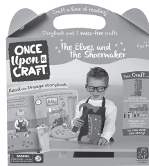
EI-1114 The Elves and the Shoemaker