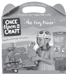
EI-1113 The Frog Prince