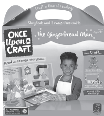
EI-1115 The Gingerbread Man